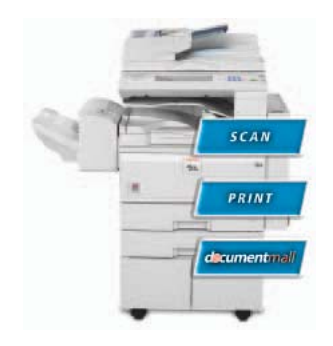
For secure document storage, management and distribution via the Internet