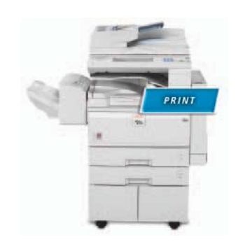
For an affordable printing solution with a flexible upgrade path for scanning and faxing