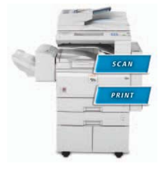
For productive printing and document handling