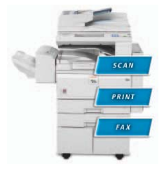
For total document needs in a space-saving design